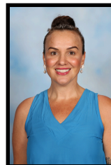
Skye Power Guidance Officer 9, 10, 11 & 12 Mon - Wed