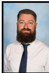
Matt Brooks Technologies